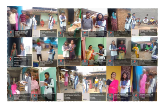
Tmage 2: Photographs taken during the village survey