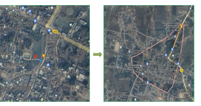
Image 1: Image showing geographical location of the village Dipatoli